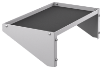
NCTCSS NC Cart Side Shelf