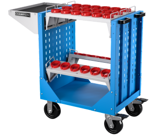
NCTCH-XX HSK TOOL HOLDERS