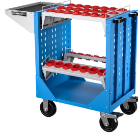
NCTC-XX CAT TOOL HOLDERS