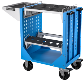
NCTCC-XX CAPTO TOOL HOLDERS