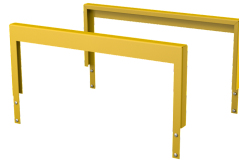
NCTCSB NC Cart, Safety Bar Set