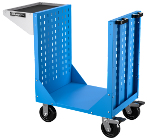
NCTC-XX NO TOOL HOLDERS