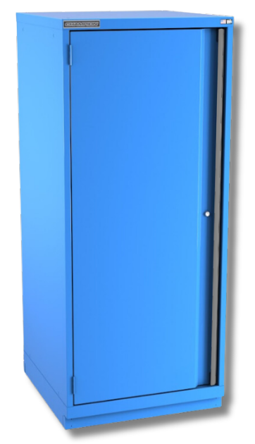
STANDARD FLUSH DOOR CABINET

Shallow Depth Standard Depth 22.5" 28.5"