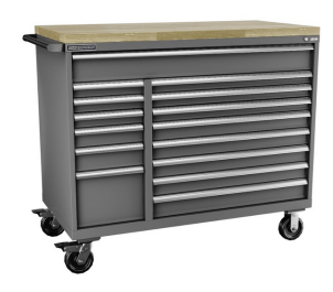
HIGH DENSITY Store more in less space.