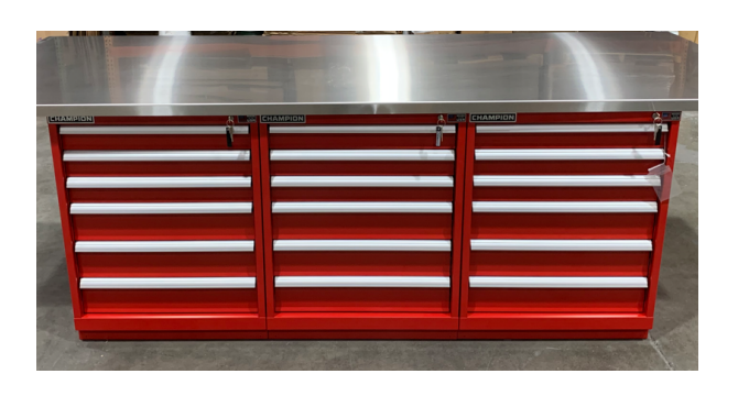
Clean Room All Stainless