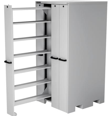
LOW PROFILE SHELVES