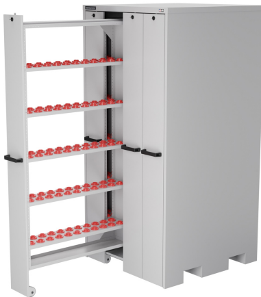
MULTIPLE TOOL HOLDERS

Contact our sales team to build a custom configured unit to meet your exact needs.